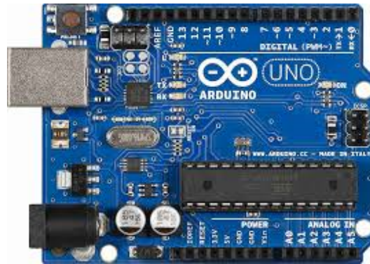
Figure 4 Servomotors

The Main Algorithm for condition for Correct Steering is: