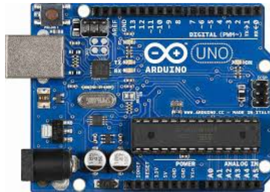
Figure 3 Arduino

Arduino programs are written in C/C++. The Arduino IDE comes with lots of software/hardware library. The files make many common input/output operations much easier. And it's easy to program even for a beginner. The Arduino programming environment is easy-to-use for beginners, yet flexible enough for advanced users to take advantage of as well.